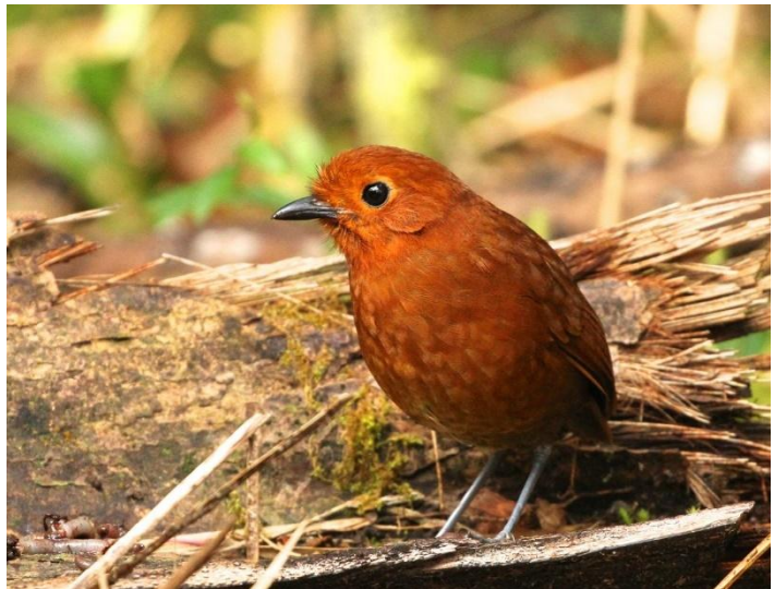
Chami Antpitta, Western Andes above Jardín, Colombia

November 10, Day 5: Full Day in Mountains Above Jardín, and in the Area of Reserva Natural Loro Orejiamarillo (Yellow-eared Parrot Reserve). This morning we’ll depart quite early for the approximately one-and-a-half-hour trip via 4-wheel drive vehicles to this small but important reserve owned by the ProAves conservation organization. Established in 2006, this reserve of circa 300 hectares (741 acres) protects one of Colombia’s rarest birds, the critically-endangered Yellow-eared Parrot (endemic). In most areas this species utilizes tall, high-elevation wax palms ( Ceroxylon spp.) for roosting and for nest holes, although it has