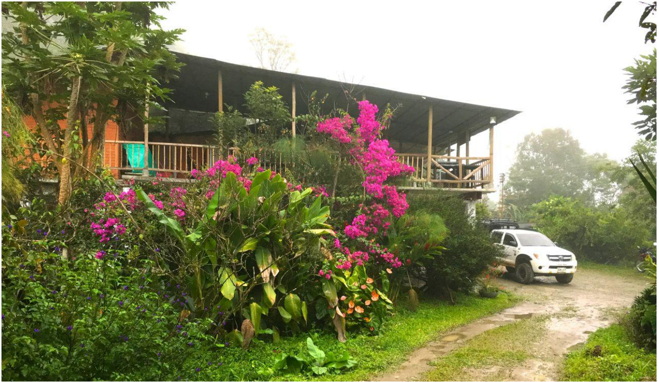
Montezuma Lodge, near Tatamá National Park

gain the upper elevations of Cerro Montezuma, we may have to walk to reach higher elevations (ca. 2,400 m.; 7,874 ft.). Getting to the top is likely to be an adventure in any case, and there will certainly be birds along the way.