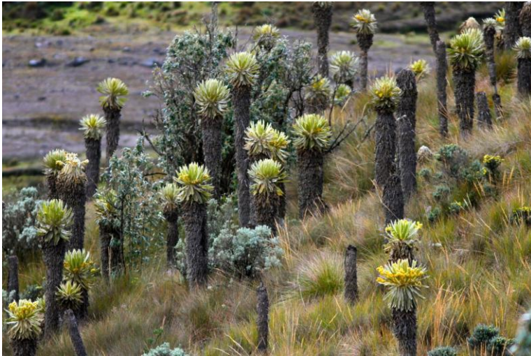
Páramo vegetation on Nevado del Ruiz near Manizales, Colombia

We plan to reach elevations of about 4,138 m. (13,655 ft.), the highest of the tour today, and most of the day will be spent between about 3,400-4,050 m. (11,155-13,287 ft.) At such elevations, temperatures can be cold, especially during the early hours of the morning (although it is remarkably pleasant some mornings). We will go only as far as the national park entrance because all of the key high elevation specialists of the low, damp elfin woodland mixed with páramo can be found here and a little lower. Among them are the delightful little Buffy Helmetcrest (formerly known as Bearded Helmetcrest prior to a four-way taxonomic split), Stout-billed Cinclodes , Tawny Antpitta, Andean Tit-Spinetail, White-