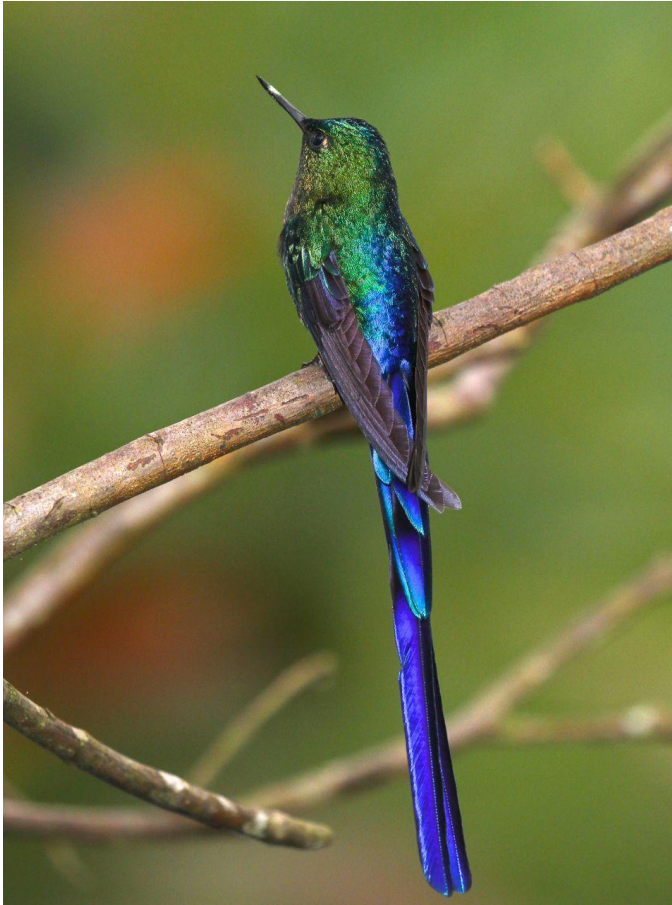
Violet-tailed Sylph, Montezuma Lodge

Tanager (endemic), Indigo Flowerpiercer (near endemic), Golden Tanager, Saffron-crowned Tanager, Golden-naped Tanager, Silver-throated Tanager, Bay-headed Tanager, Scrub Tanager, Blue-necked Tanager, Black-capped Tanager, Beryl-spangled Tanager, Flame-faced Tanager, Rufous-throated Tanager (this is an astonishing 11 species of tanagers, all formerly in the genus Tangara , found here!), Blue-winged and Black-chinned mountain-tanager, Dusky and Yellow-throated chlorospingus (formerly Bush-Tanager), Crested Ant-Tanager (endemic and surprisingly common here), Choco Brushfinch (also as Tricolored Brushfinch), Black-winged Saltator, Chestnut-breasted Chlorophonia, and Thick-billed and Orange-bellied euphonia. This also may be one of the best places to see the remarkable Club-winged Manakin (dance/wing display video available on YouTube), a species we have seen on most of our visits here. There's a lot to look for but with two and a half days, we hope to see a good many of them.