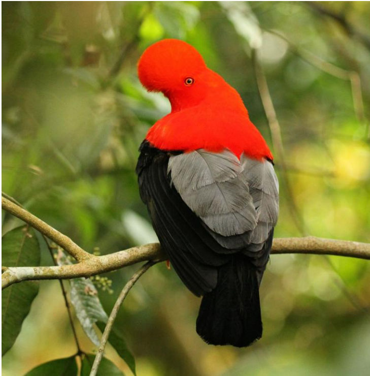
Andean Cock-of-the-rock, Jardín, Colombia

recently been found in one site without these palms. A combination of deforestation and palm cutting has deprived this species of much of its natural habitat and critical nest hole sites. Once common and widespread in the Colombian Andes, the population plummeted to perhaps a few hundred individuals a few decades ago. The establishment of protected reserves, public education programs and the construction of artificial nest boxes by dedicated conservationists have helped to re-establish this species in several areas; the present population has climbed to an estimated 750-1,000 birds and recently heretofore unknown populations have been discovered in the Eastern Andes. Although formerly found in north central Ecuador, the species may no longer occur in that country and now survives only in Colombia.