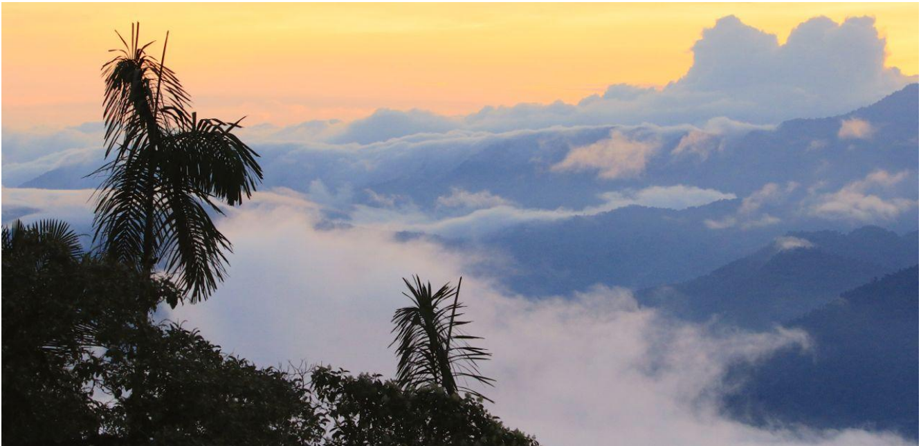
Dawn on Cerro Tatamá, Western Andes

Colombia is often referred to as the ultimate birding destination, the “holy grail” for birders. There are two reasons for this; one being that more birds have been recorded in Colombia than in any other country on the planet—now over 1,950 species—and the second being that, for two decades, civil unrest had made visiting remote areas within the country almost impossible. During that time, birders had looked longingly at the illustrations in Steve Hilty’s 836-page Guide to the Birds of Colombia, (often referred to as the “bible” for Colombian birds), and longed for the chance to see some of these remarkable birds. And then that opportunity arrived in 2009 when VENT returned to Colombia (the first commercial company to do so). Additionally, there are now three new guides to Colombia’s immense avifauna, including Hilty’s new and highly recommended Birds of Colombia published (2021) by Lynx