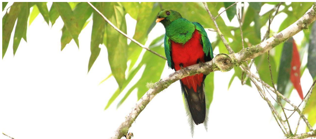
Golden-headed Quetzal, Western Andes

We will spend the morning at Finca La Florida, and have lunch here or nearby. In addition to some spectacular tanagers, numerous hummingbirds also are usually present including White-necked Jacobin, Green Violetear, Black-throated Mango, Blue-headed Sapphire (rare and seasonal), Booted Racket-tail, Andean Emerald, Bronzy Inca, Brown Inca (seasonal), Fawn-breasted Brilliant, Buff-tailed Coronet, Long-tailed Sylph, and Purple-throated Woodstar. We also have seen Golden-headed Quetzal and Emerald Toucanet in this general area.