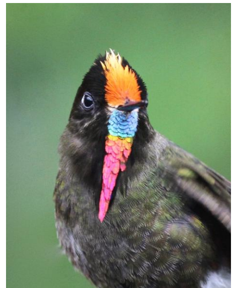
Rainbow-bearded Thornbill, Nevado del Ruiz

November 13, Day 8: Morning at Hacienda El Bosque and Afternoon Drive to the City of Pereira. This exciting new site offers hummingbird feeders and two antpitta feeding sites with a chance for one of the cutest of all antpittas, the Crescent-faced Antpitta. In the surrounding mosaic of forested valleys there also is a good chance of seeing the spectacular Gray-breasted Mountain-Toucan and Barred Fruiteater, as well as numerous tanagers and other highland species. Following the morning here, we will pass back through Manizales and continue directly on to Pereira, a city just over an hour to the south. The road